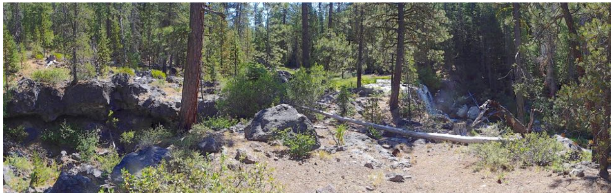
Paulina Creek today (at right) flows over a small waterfall just to the south of the huge dry falls (at left).