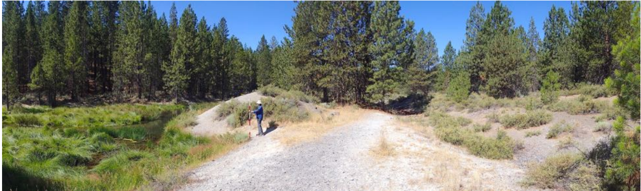
At Ogden Group Camp, where the creek meets the prairie, long gravel bars were deposited, 6-8 feet high.