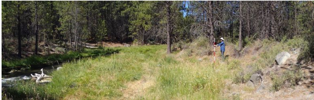
Boulders up to 3' in diameter were embedded in the gravel bars and scattered across the floodplain.