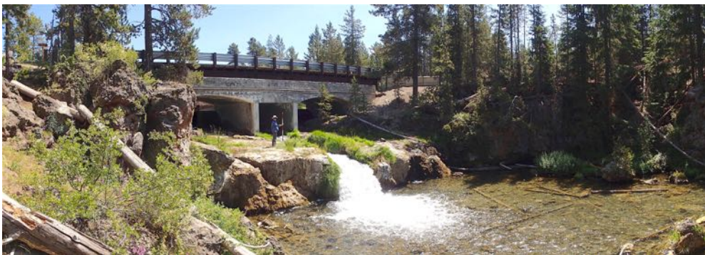
...but just below the dam, the stream is slowly eroding away the rock sill holding up the lake.