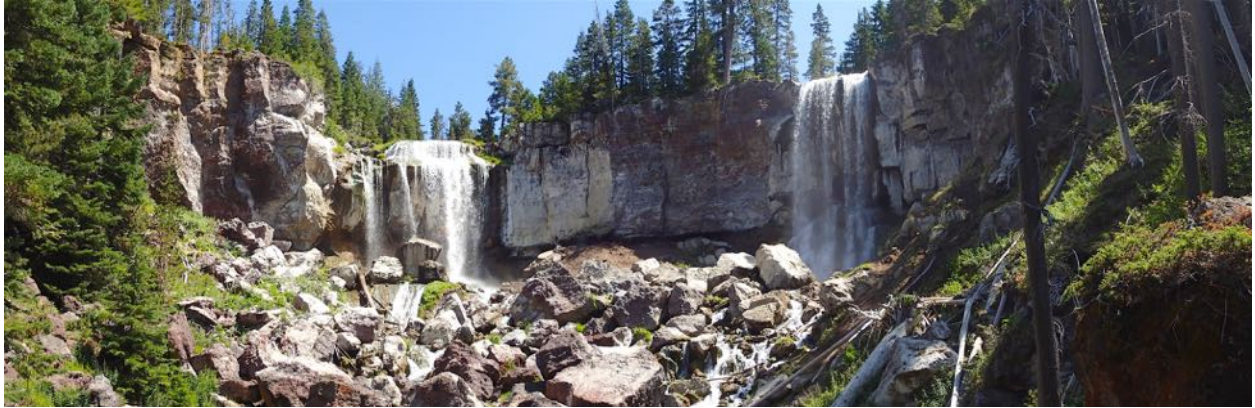
Paulina Falls today continues to migrate toward the lake, just like the original falls that created the flood.