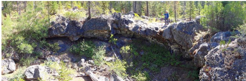
Five miles upstream is a huge, abandoned dry waterfall, scoured out by the cataclysmic flood.