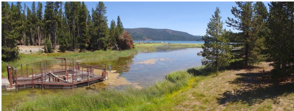
The modern-day outlet of Paulina Lake is protected by a concrete dam and fish screen...