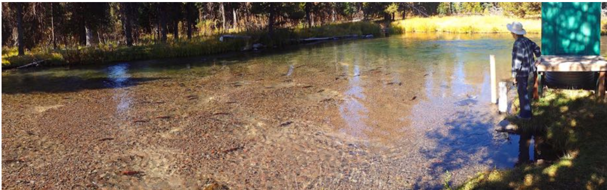
...though the best place to observe kokanee up close is 100 yards upriver at the stream gaging station.