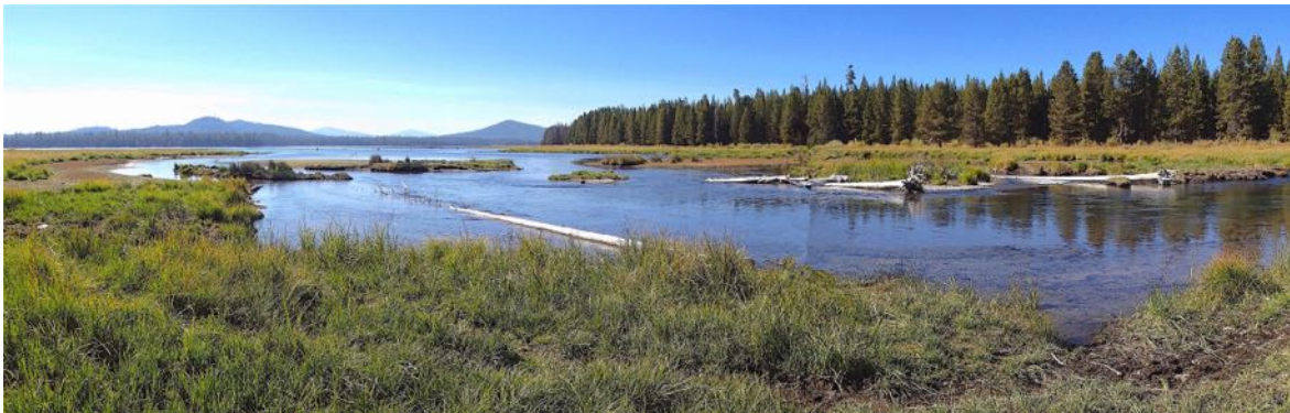
From the bridge, a trail winds 350 yards downstream to the river mouth at Crane Prairie Reservoir...