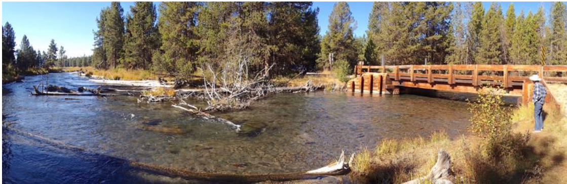
The Cow Meadow bridge over the Upper Deschutes is a premier spot to see spawning kokanee.