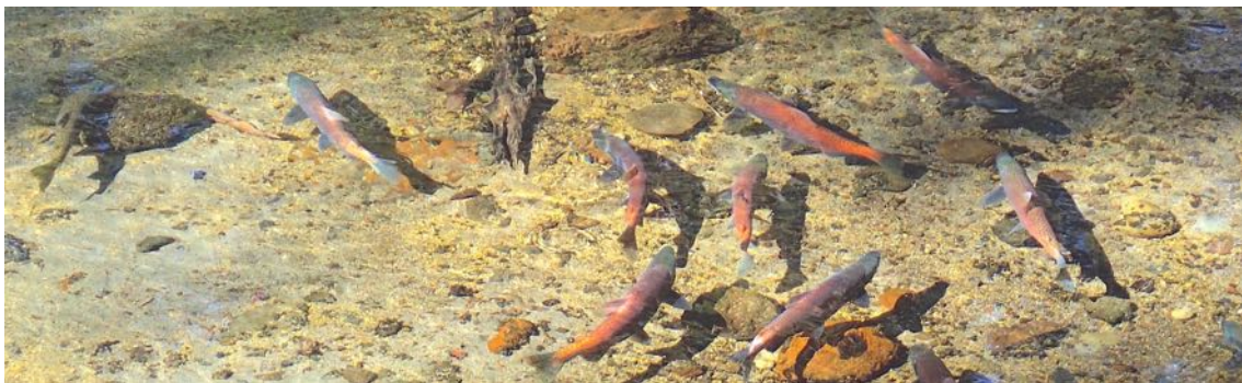
In the clear, still water below the headwaters spring, one gets an up-close view of the spawning fish.