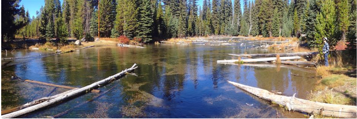
The old Cultus River crossing is a good spot to look for bald eagles preying on the spawning kokanee.