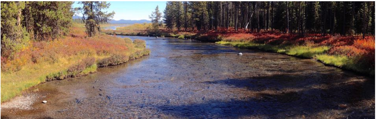
The spring-fed Quinn River, only 250 yards long, is a colorful, intimate spot to see kokanee as well.