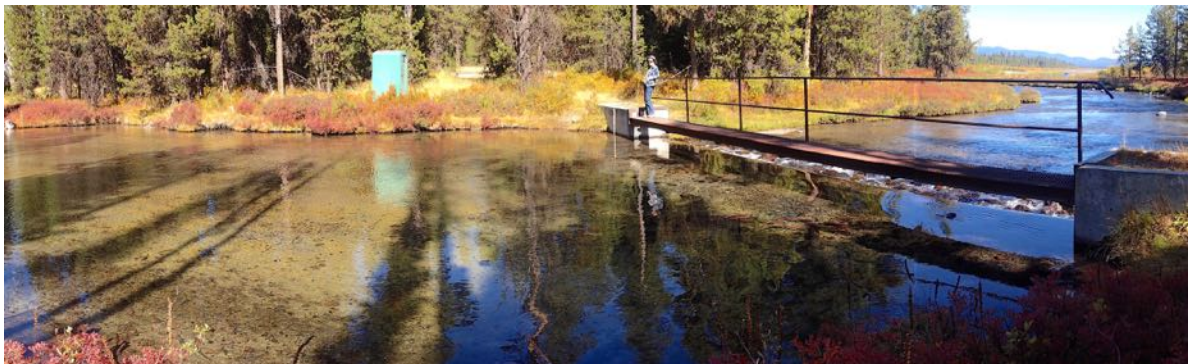
There's even a convenient steel footbridge for fish viewing here, next to the Quinn River gaging station.