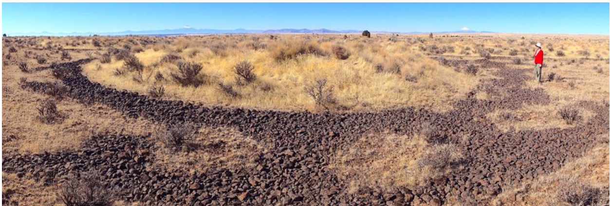
Across this area, the rings of basalt rocks form an intricate network winding among the mima mounds.