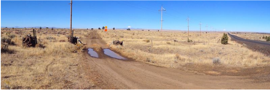
The route begins at a yellow cattle guard on unsigned Rooper Road, off the Antelope-Shaniko Hwy.