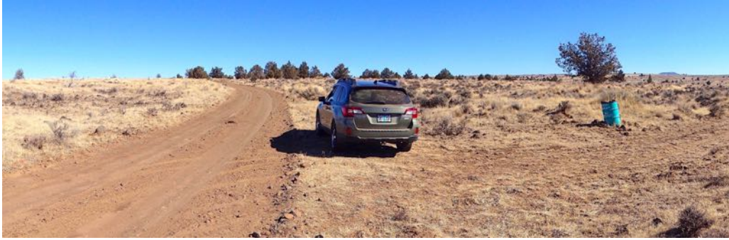
Most of the land along Rooper Road is BLM, but a few private tracts are marked with blue-green drums.