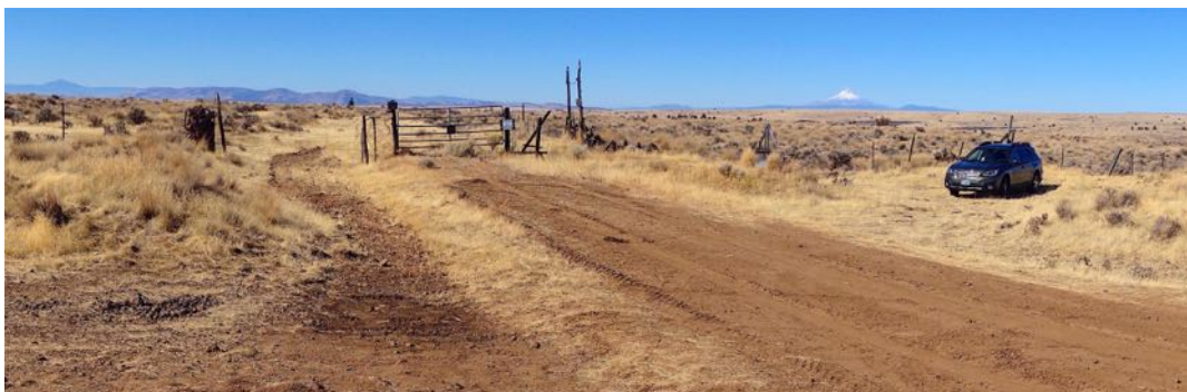
At 3.1 miles, the road ends at a locked gate, with the Nature Conservancy's research preserve beyond.