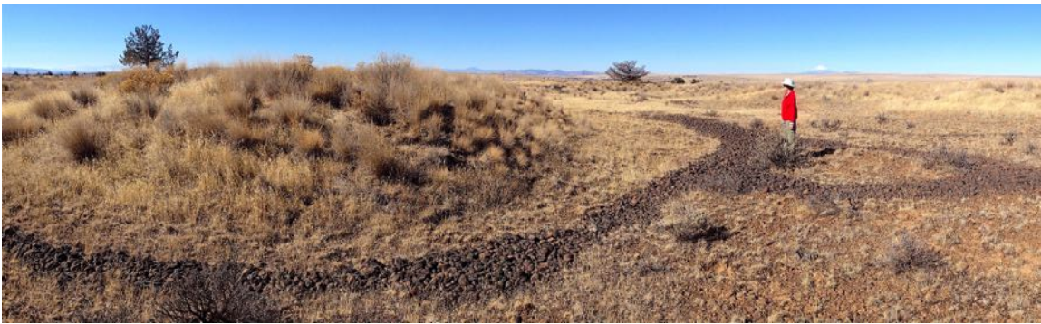
The largest mounds with the most complete rock rings are found on the flat uplands, within the first mile.