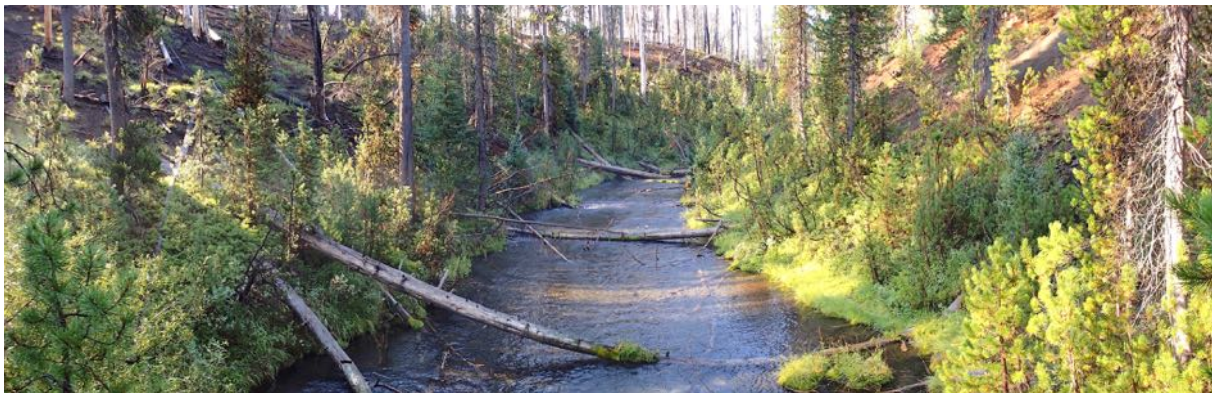
At 0.9 miles, the trail crosses from the east to west bank of the Rogue River at the Road 760 crossing.