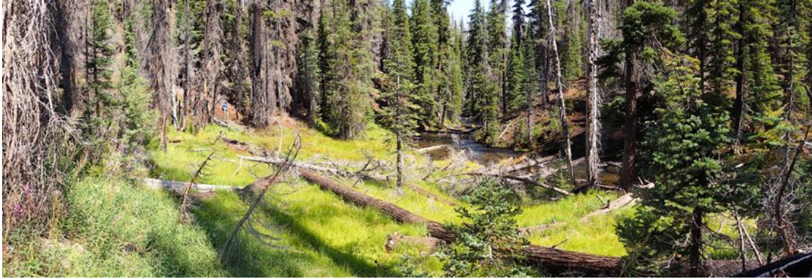
At 2.0 miles, the trail descends into the headwaters through a lush meadow fed by the first springs.