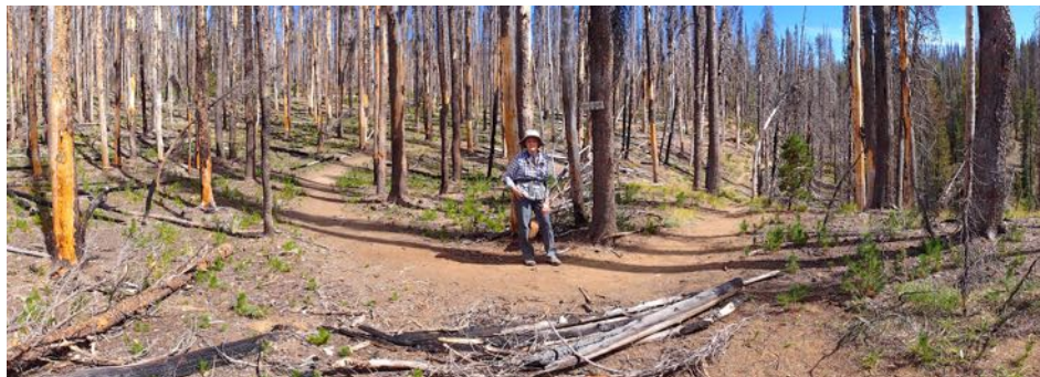
For a half mile, one winds through burned, ghost forest to the junction with the Boundary Springs Trail.