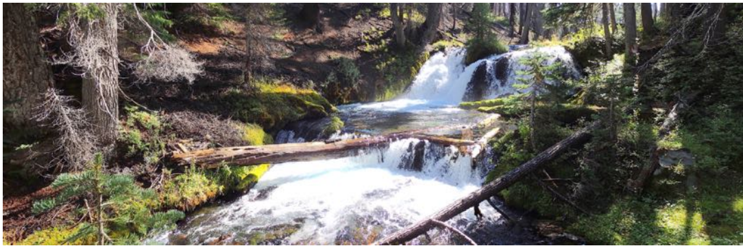
In sections with a steeper gradient, one finds cataracts and waterfalls. Look for water ouzels in the pools.