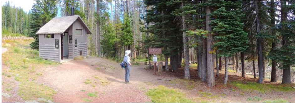
The hike begins on the Upper Rogue River Trail from the Mt. Mazama Viewpoint parking area.