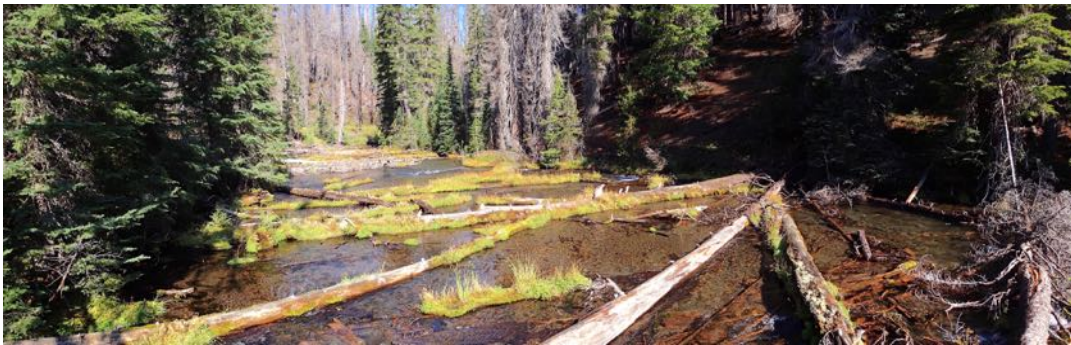
Just upriver, where the gradient is low, old logs covered with yellow monkeyflower jam the stream.