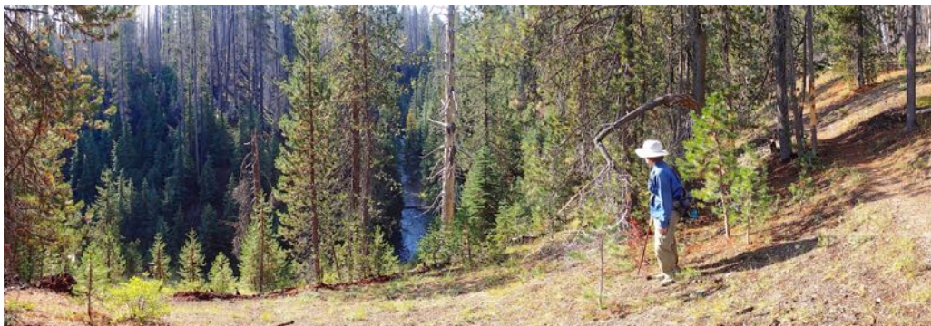
For the next mile, the trail follows the high bluff along the river, 50'-150' above the rushing stream.